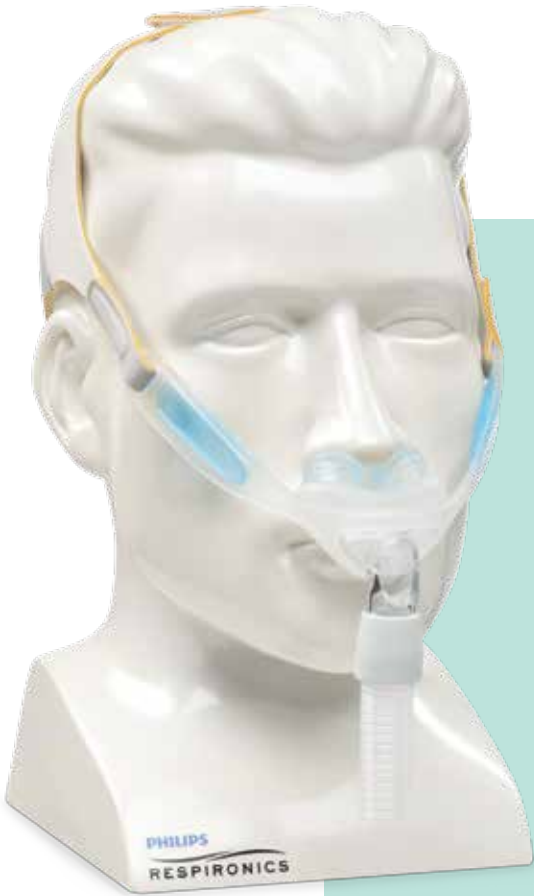
Nuance Pro mask